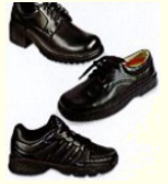
Acceptable Shoes Leather Lace up

The school holidays are a good time to check the state of your student’s shoes. If buying new ones, please remember that plain black lace-up school shoes are to be worn with the formal uniform and plain white lace-up joggers with the sports uniform.