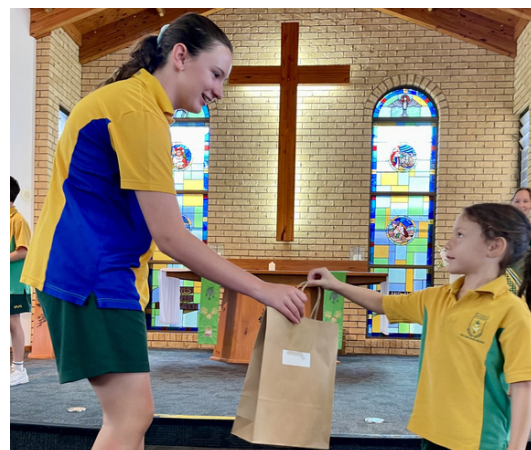
February 9: Year 6 Senior Shirt Presentation