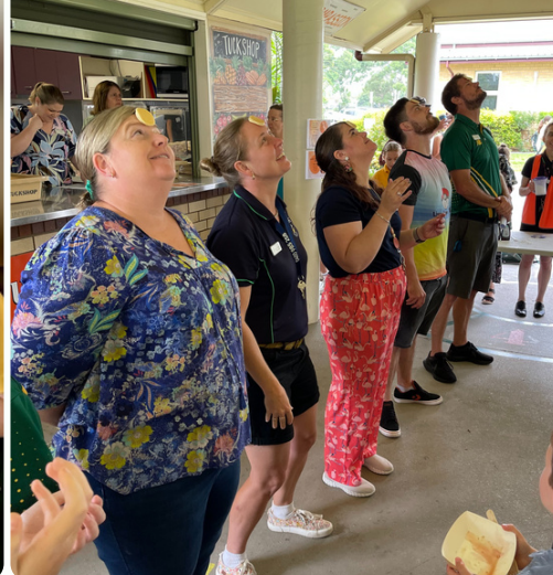
February 13: Shrove Tuesday