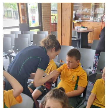
February 14: Ash Wednesday Service