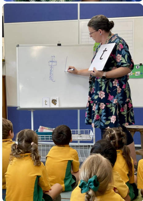
RWI in the classroom