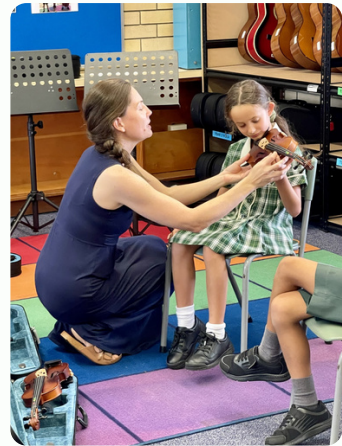
Year 3 String Immersion