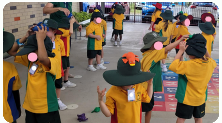
Preps Playing Party Games