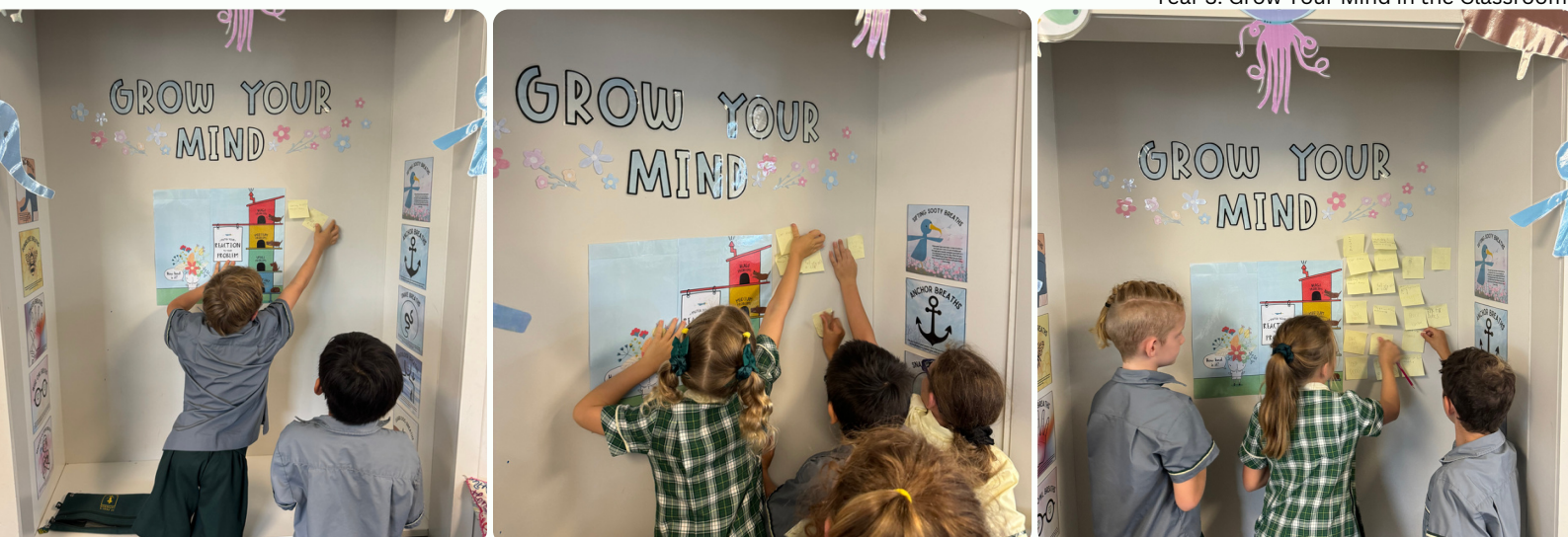
Year 3: Grow Your Mind in the Classroom