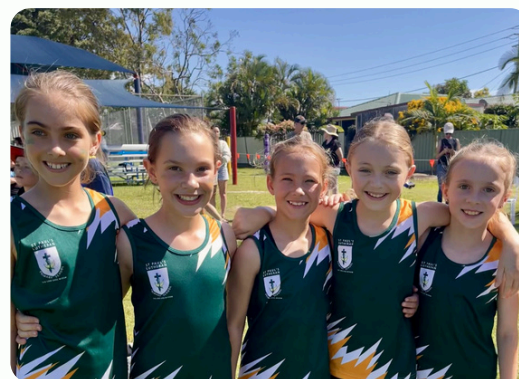
Northern Cluster Cross Country