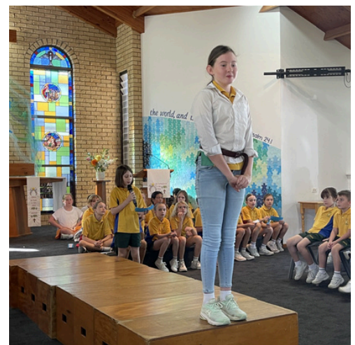
Year 5 Sunday @ 5