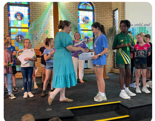
March 27th - Cross Country Presentations