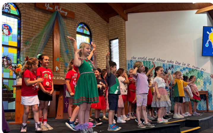
Rock Band lunch time performance and End of Year Choir Performances