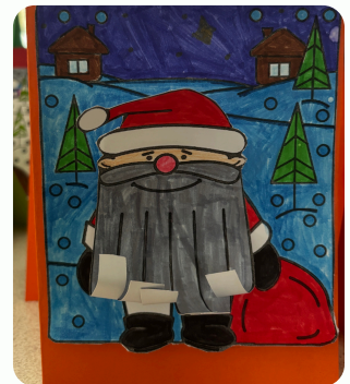
Images of Year 3 and 4 Christmas Craft and Cooking.