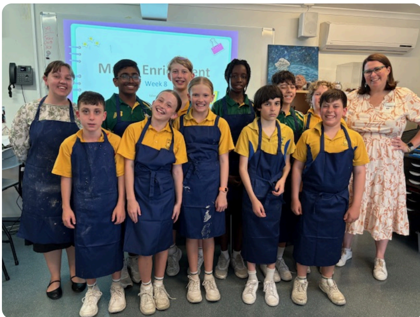
Images: Year 5 and 6 Maths Extension group in conjunction with Grace Lutheran College

Blessings to you and your family as you celebrate Christmas.