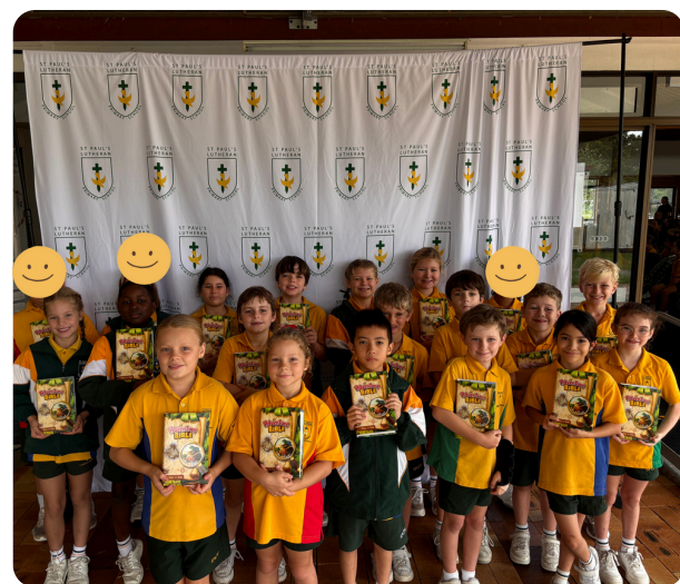
Year 3 and New Students Bible Presentation from the St Paul's Lutheran Church.