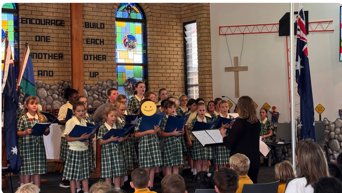
Senior Choir singing at the School ANZAC Service