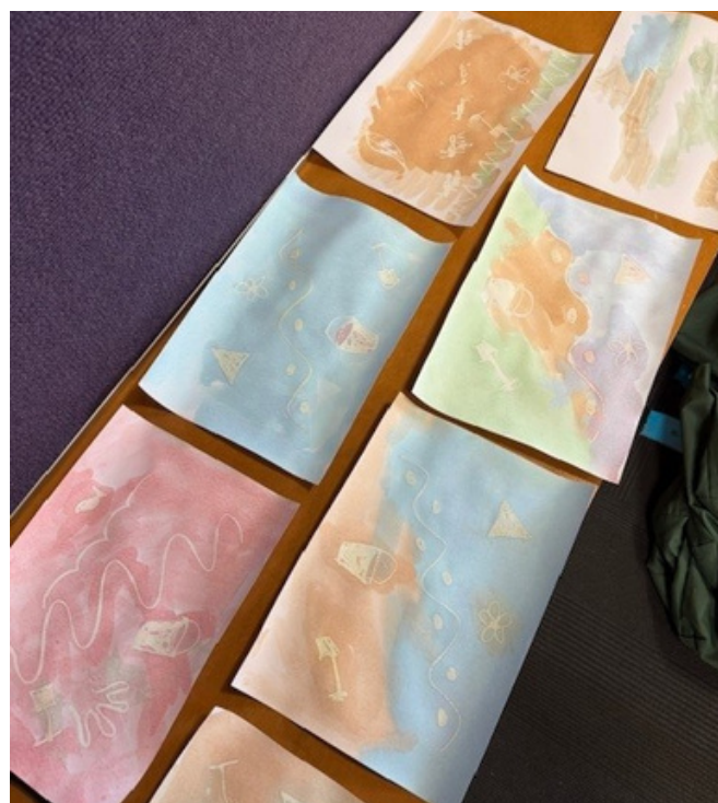
Pictured: oil pastel and watercolor resist with Prep