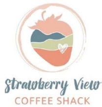
Strawberry View Café

We would like to give a heartfelt thank you to the following businesses for their generous support of our P & F: