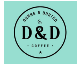
Dunne and Dusted Coffee Shop Rothwell (D & D)

Your support makes a wonderful difference in our school community – we truly appreciate it!