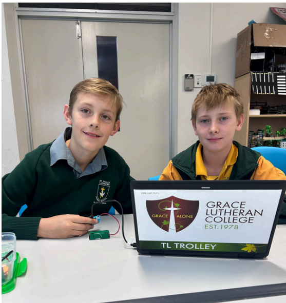
Year 5 Taste of Grace Visit