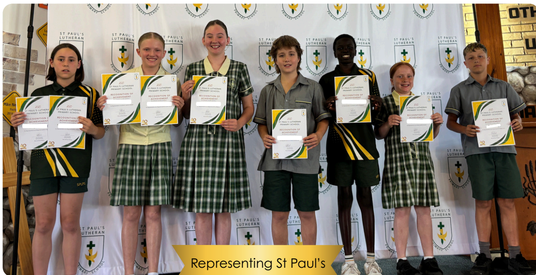
Representing St Paul's