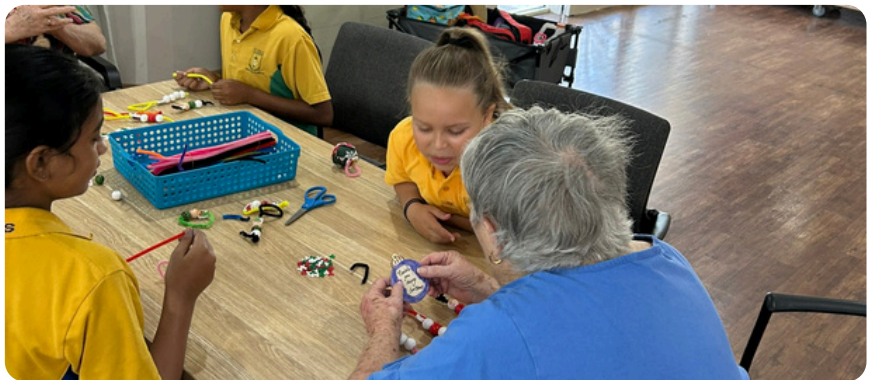
Images: Year 4 Excursion to St Paul's Aged Care Village to do Christmas craft with the residents! Thank you for having us!