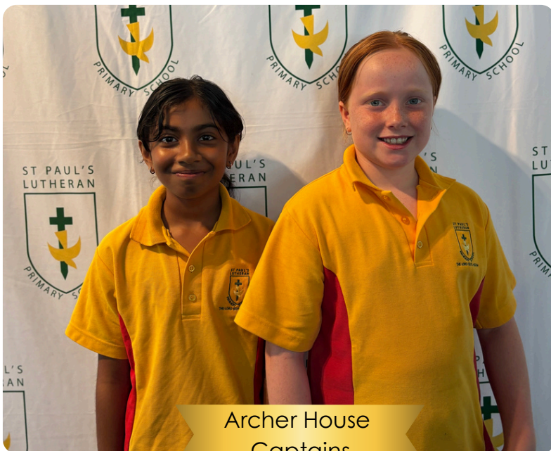
Archer House Captains