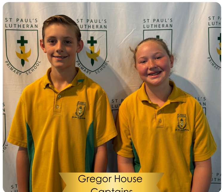
Gregor House Captains