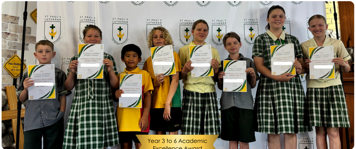
Year 3 to 6 Academic Excellence Award