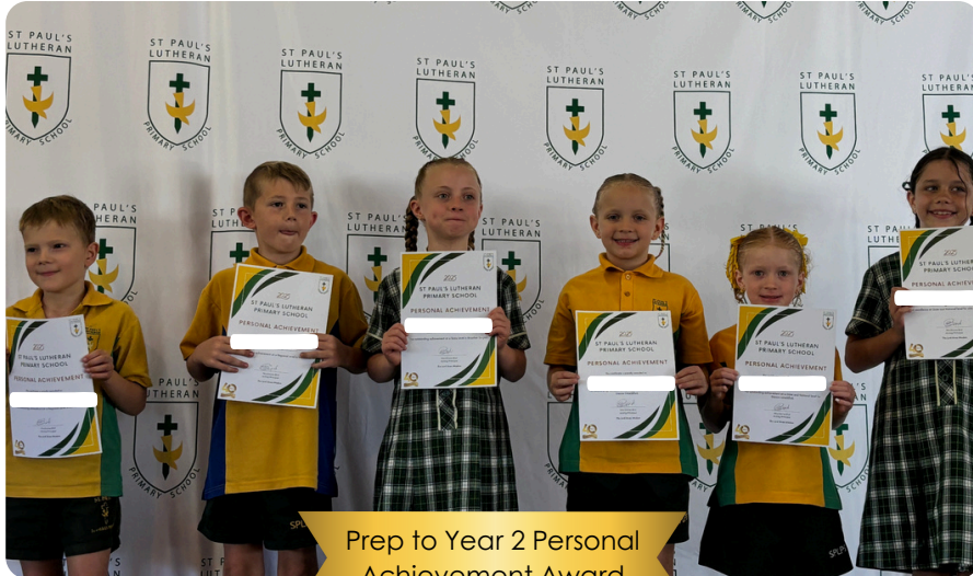
Prep to Year 2 Personal Achievement Award