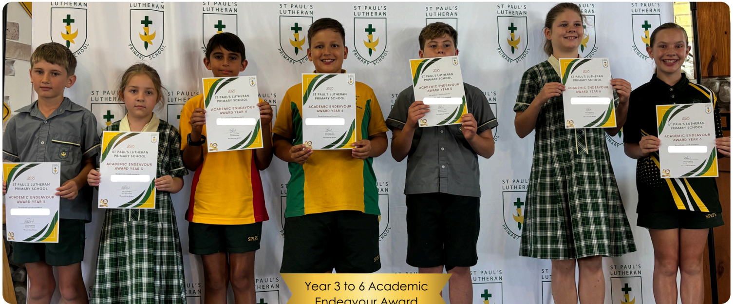
Year 3 to 6 Academic Endeavour Award