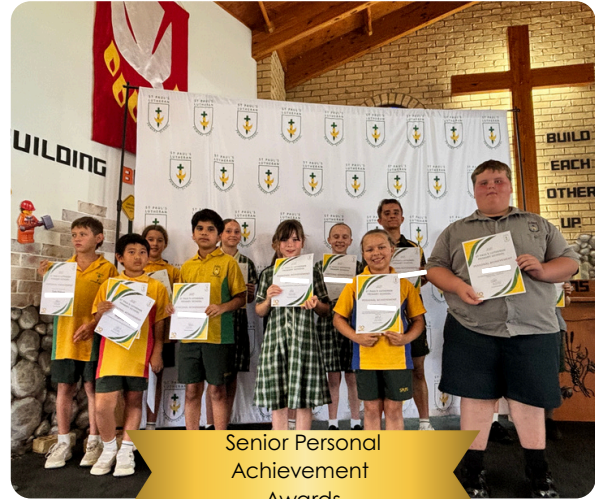
Senior Personal Achievement Awards