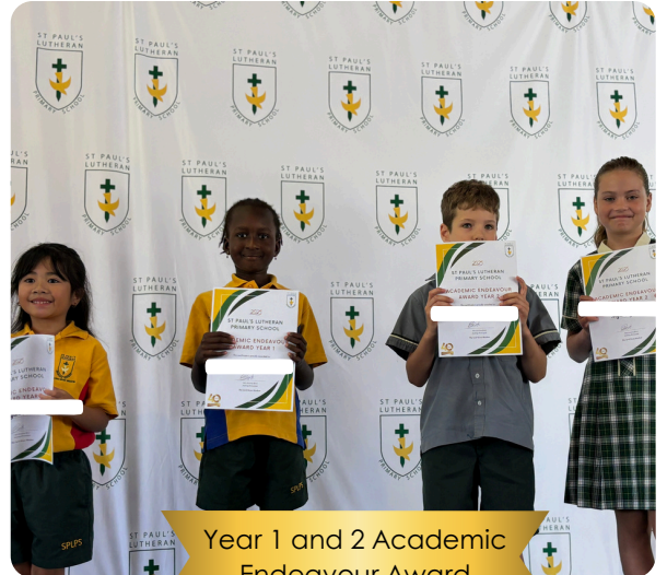
Year 1 and 2 Academic Endeavour Award