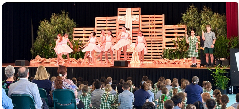
Left: Our Year 5 and 6 Liturgical Dance Team