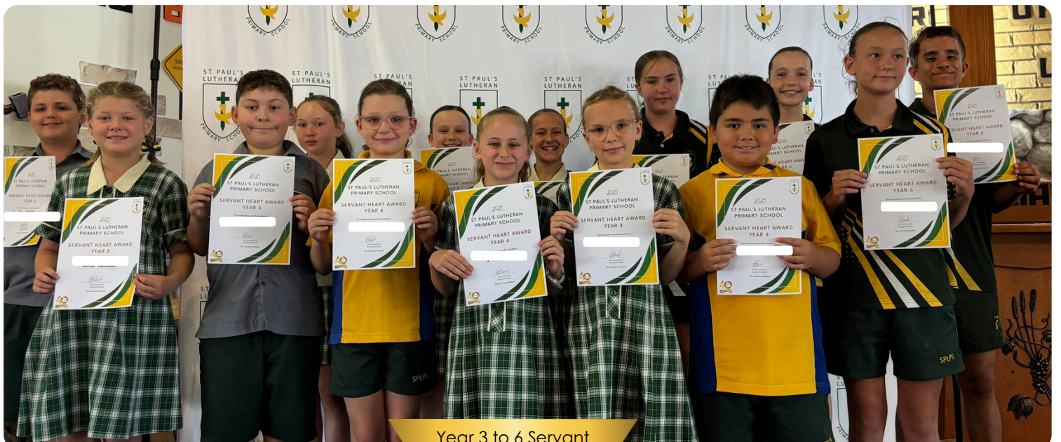
Year 3 to 6 Servant Heart Award