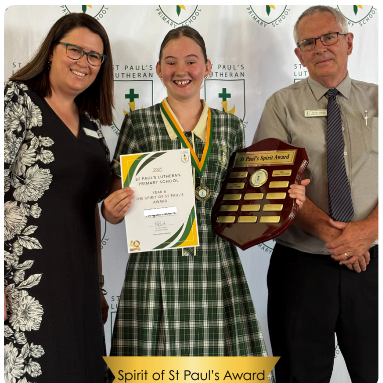
Spirit of St Paul's Award