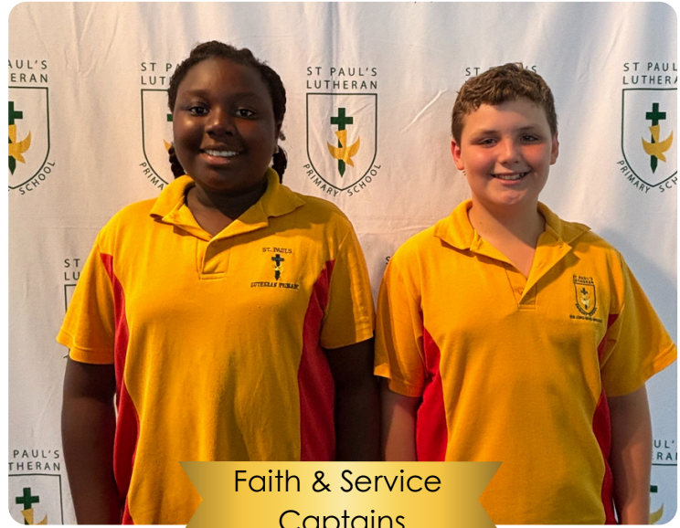
Faith & Service Captains