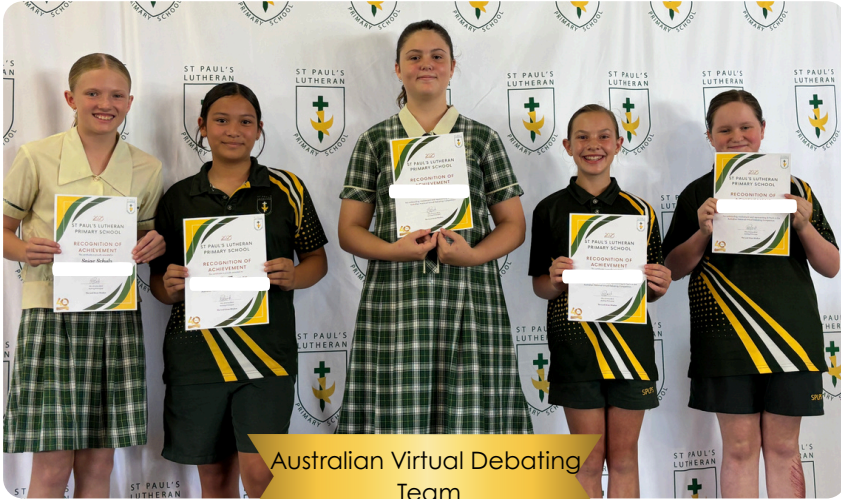
Australian Virtual Debating Team