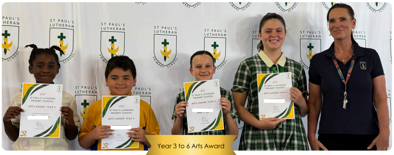
Year 3 to 6 Arts Award