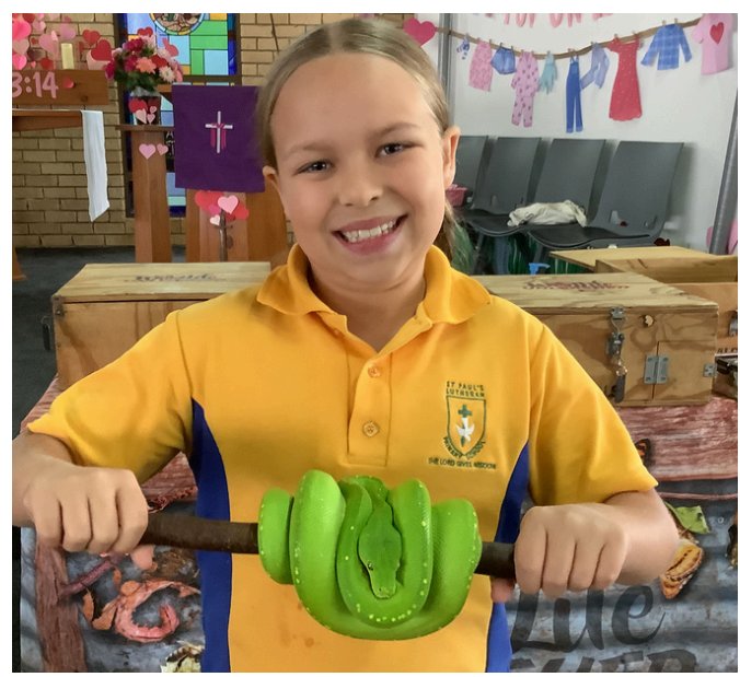
Year 5 Incursion with Wildlife Unleashed